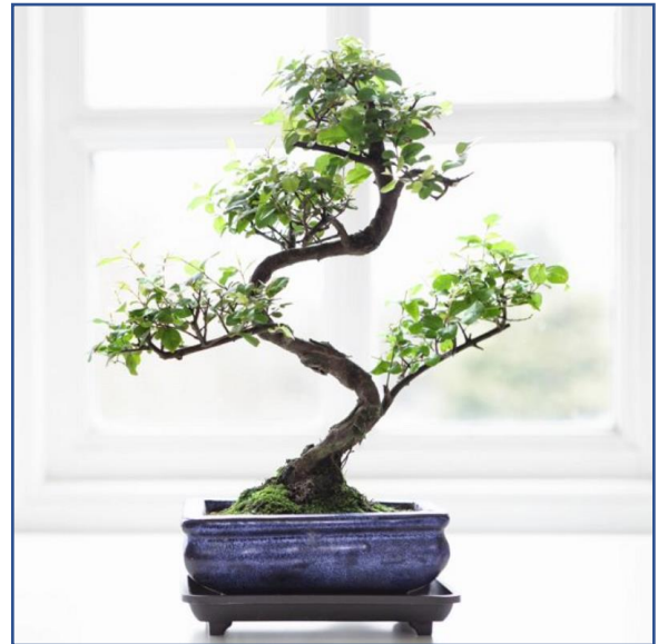
Original Image 2017

https://www.leafly.com/news/lifestyle/bonsai-cannabis-plant-growing