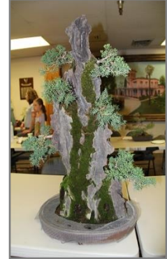
Plant on Rock