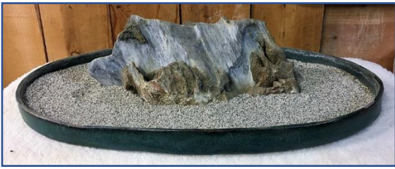
Figure 2 Susieki Stone