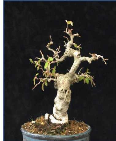
Figure 4 Korean Hornbeam